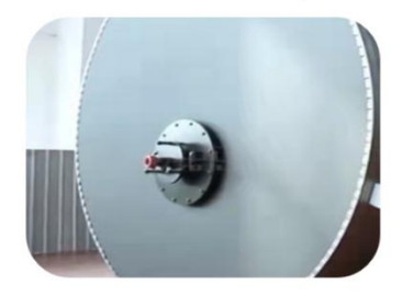
6.Bottom blow-down Function:achieve bottom blow-down of the boiler Purpose:Prevent sundry precipitation, so as to form corrosion, extend the service life of the boiler

Function:high temperature resistance,high coagulability,long service cycle Purpose:avoid smoke chamber been burned out,less heat loss,increase heat efficiency